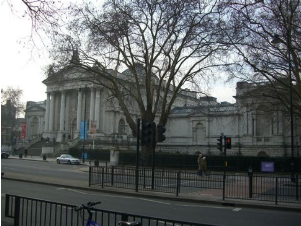
Chestnut trees along Milbank:

On Tuesday I took some shots on my way back from Tate Britain. Here are a few of those. The Tate itself, view from Milbank: