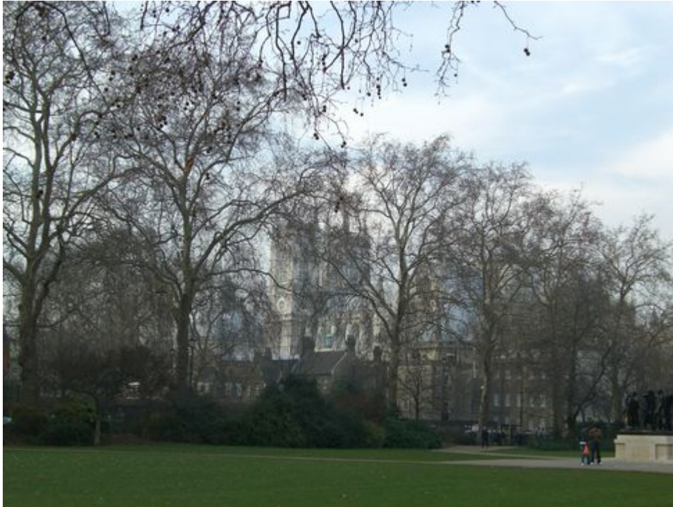
Stressed out sculpture by Whitehall: