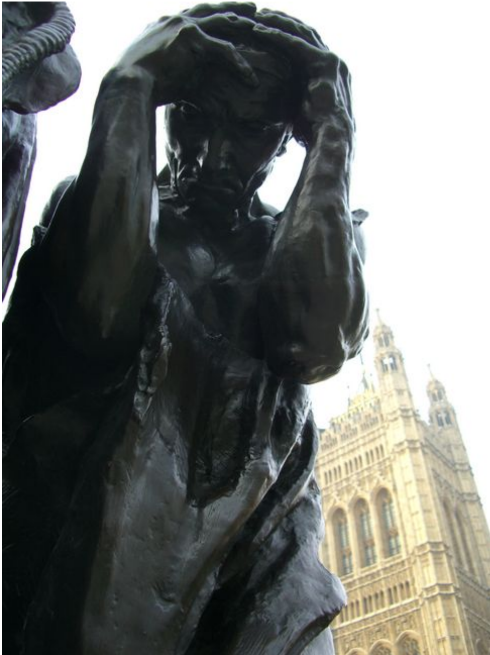
Big Ben from behind: