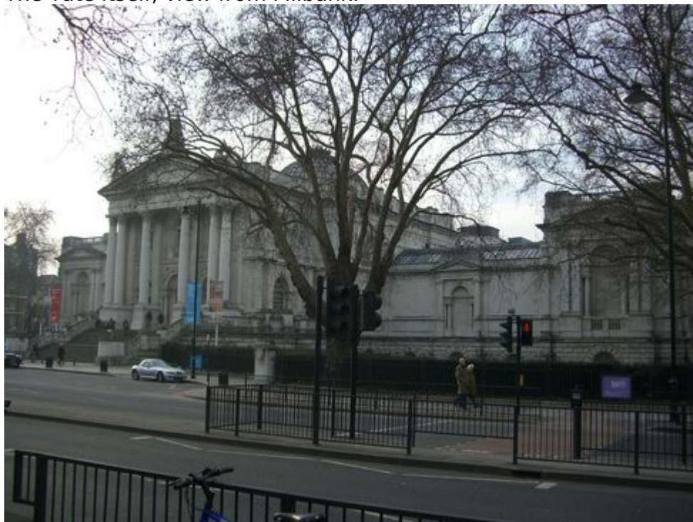
Chestnut trees along Milbank:

On Tuesday I took some shots on my way back from Tate Britain. Here are a few of those. The Tate itself, view from Milbank: