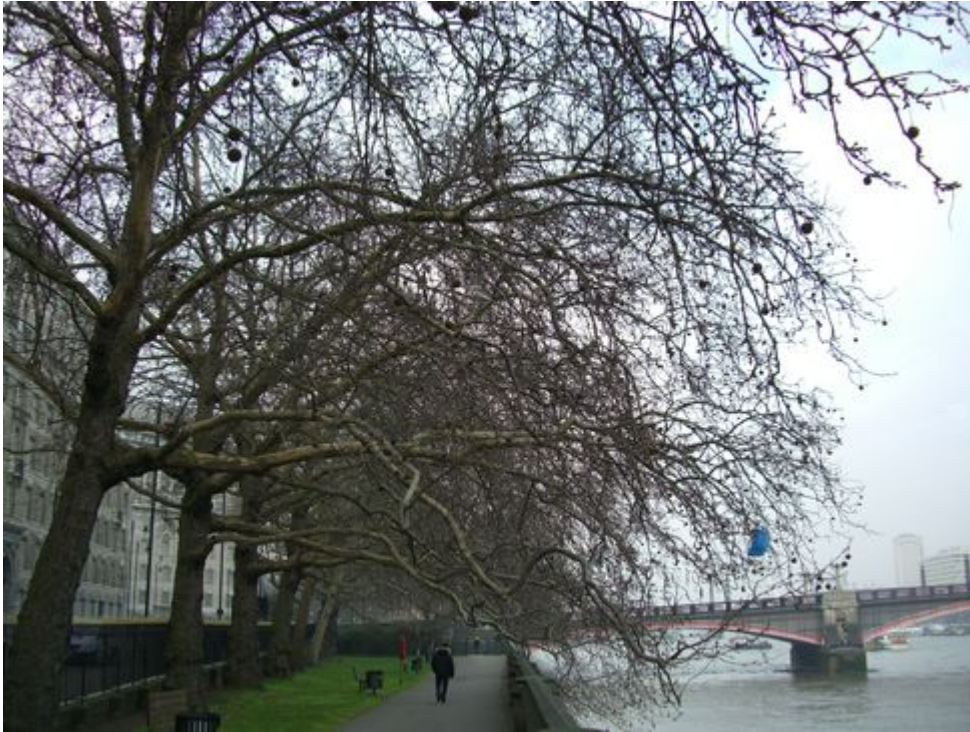
London: Old and New: