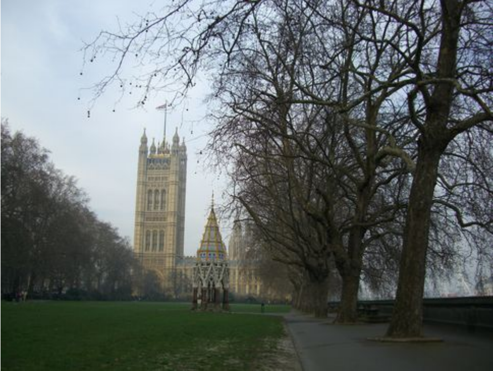
Chestnut Trees leaning over Milbank, near Houses of Parliament: