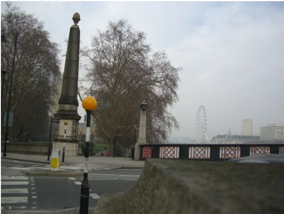
That's the Houses of Parliament in the distance on the left, Victoria Tower, and The London Eye towards the right. Houses of Parliament: