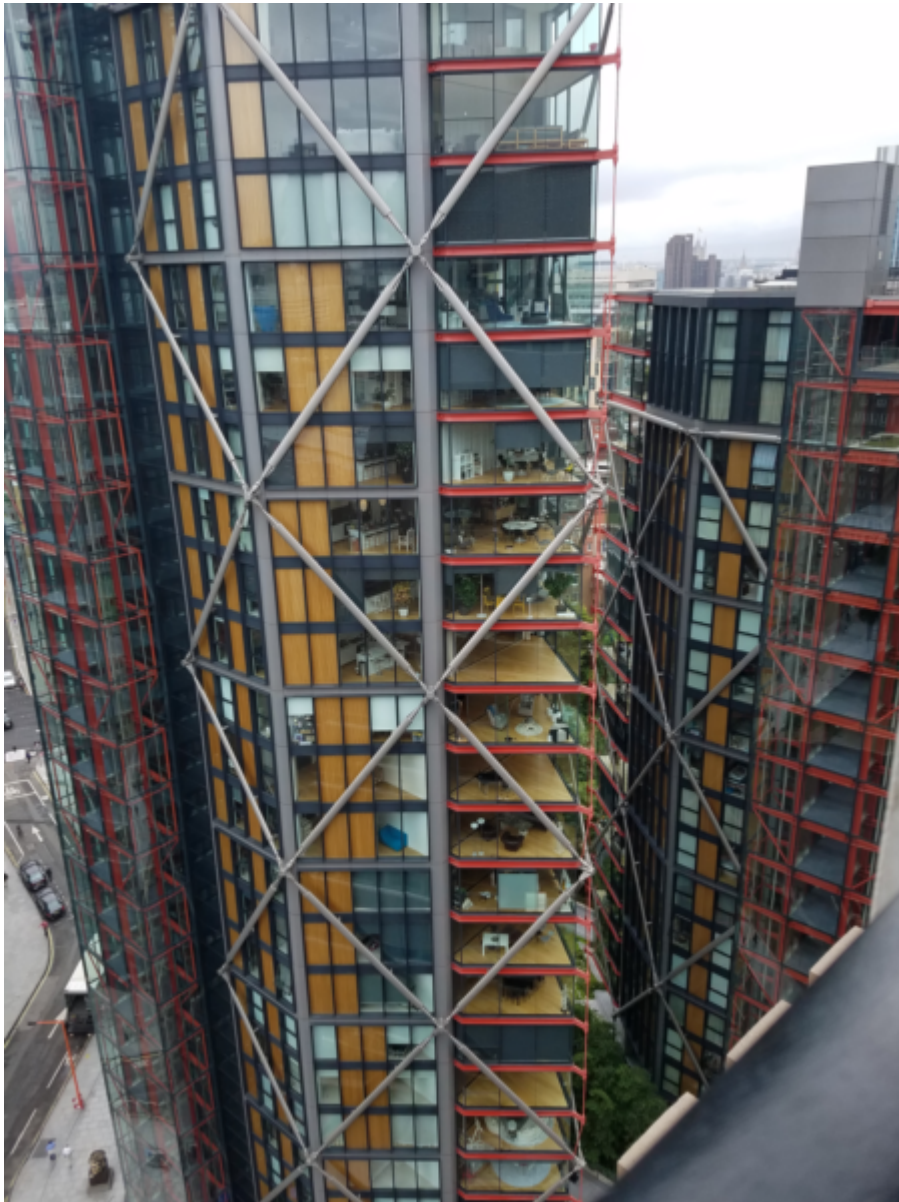
The neighbours likely didn't expect this level of exposure.