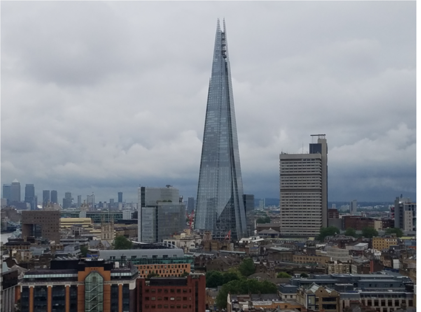
The Shard, commonly known as The Salt Cellar.