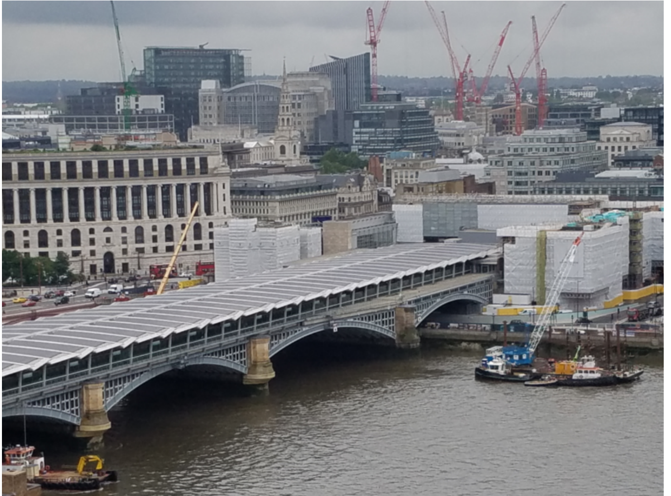
New Blackfriars Bridge.