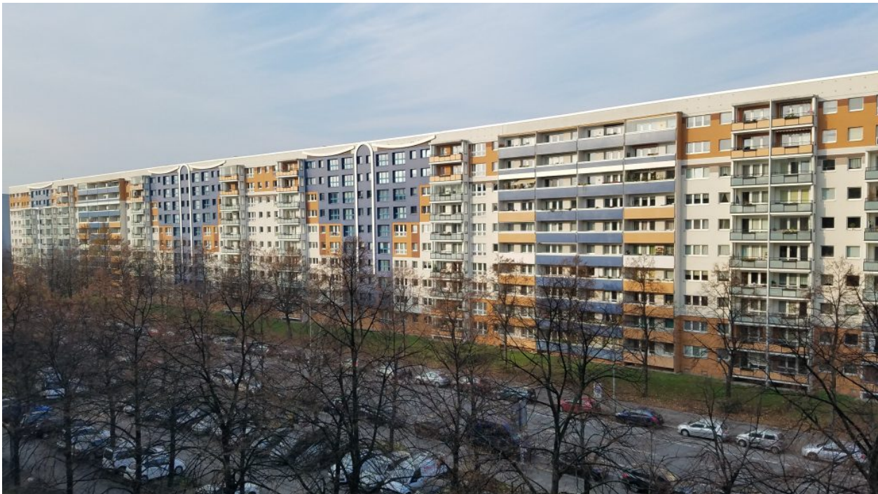
Flats along Heinrich-Heine Straße

My flat is near the intersection of Heinrich-Heine Straße and Köpenicker Straße.