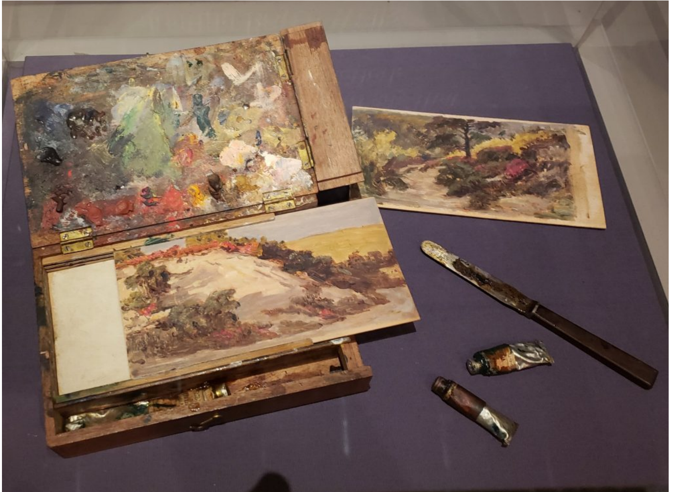
Portable paint box, circa 1850