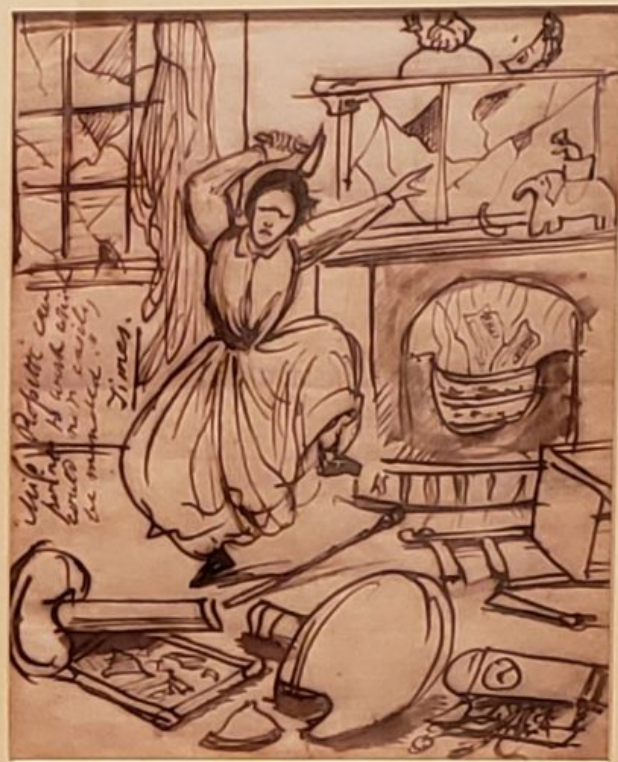
Christina Georgina Rossetti in a Tantrum, 1862, by Dante Gabrielle Rossetti