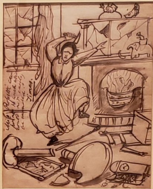
Christina Georgina Rosetti in a Tantrum, 1862, by Dante Gabrielle Rosetti