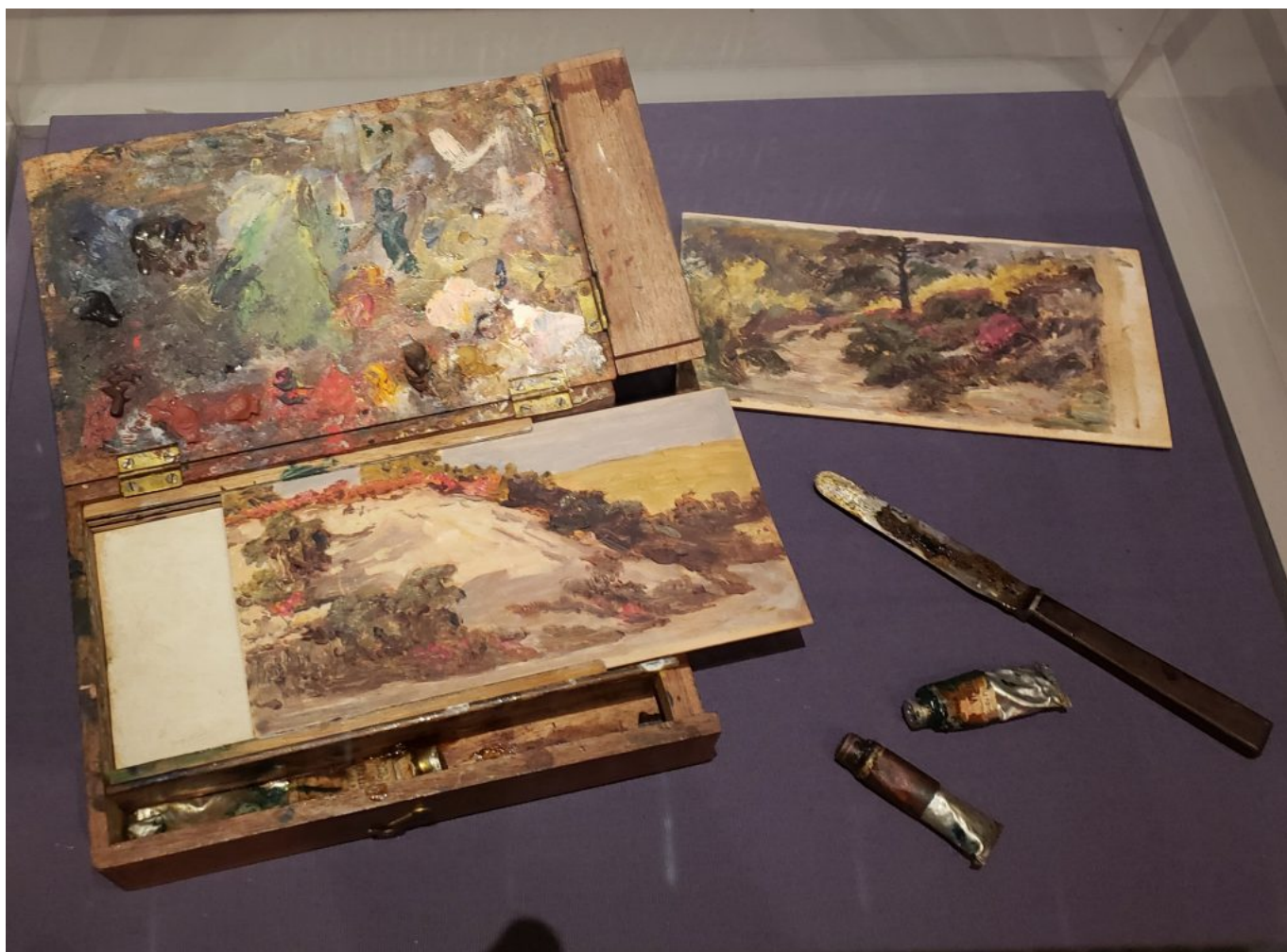
Portable paint box, circa 1850