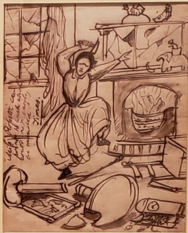
Christina Georgina Rosetti in a Tantrum, 1862, by Dante Gabrielle Rosetti