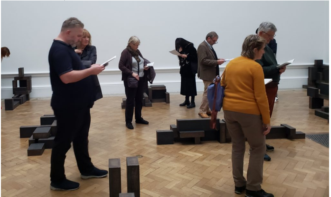
Crowds around more of "Slabworks," 2019