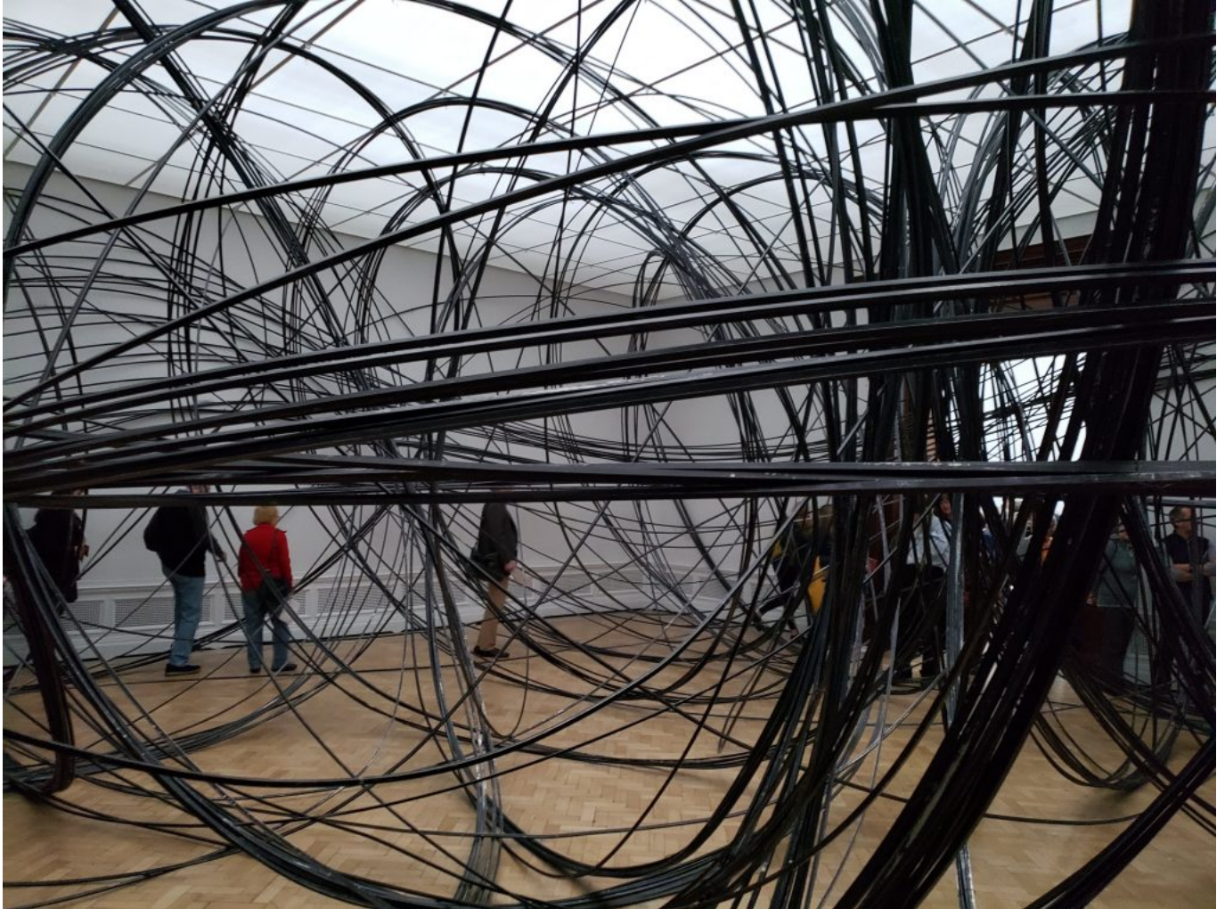
“Clearing VII” 2019 — 8 km of aluminium tubing, coiled into the gallery space and then allowed to relax.

Now we are into the modern works, and these are huge, and huge crowd pleasers. Just getting around Clearing VII took effort. Not just from clamoring over and around the unspooled tubing, but working through the crowds of onlookers.