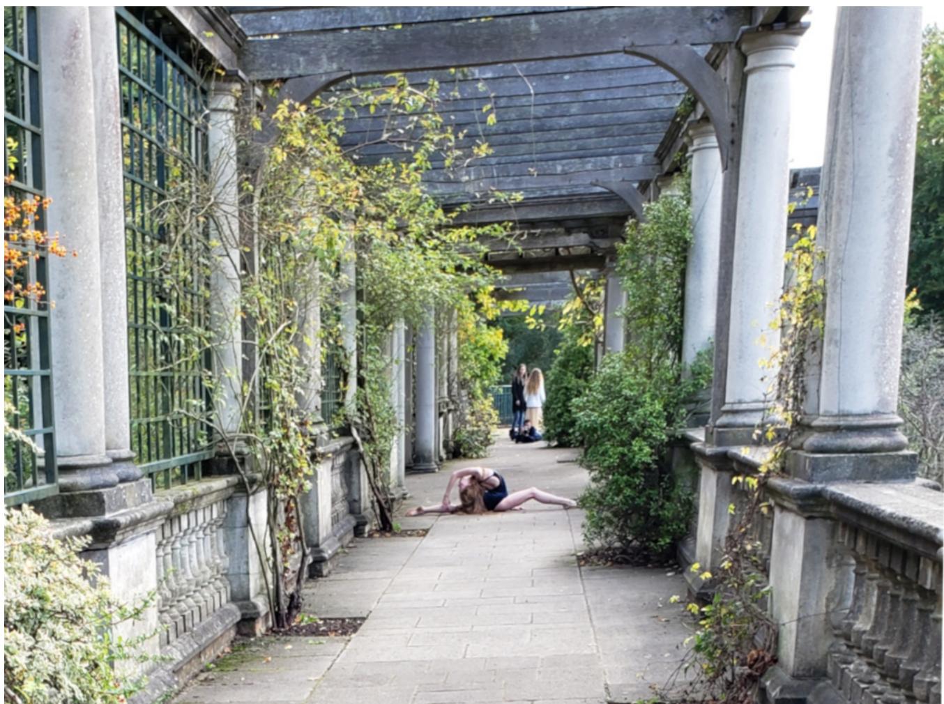
A photo shoot was going on