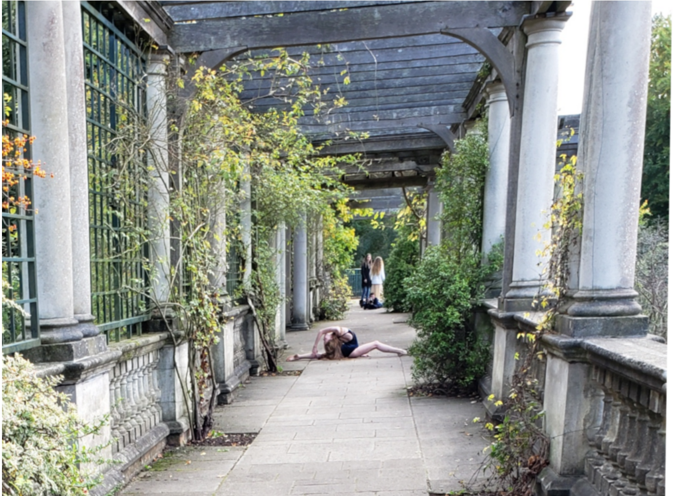
A photo shoot was going on