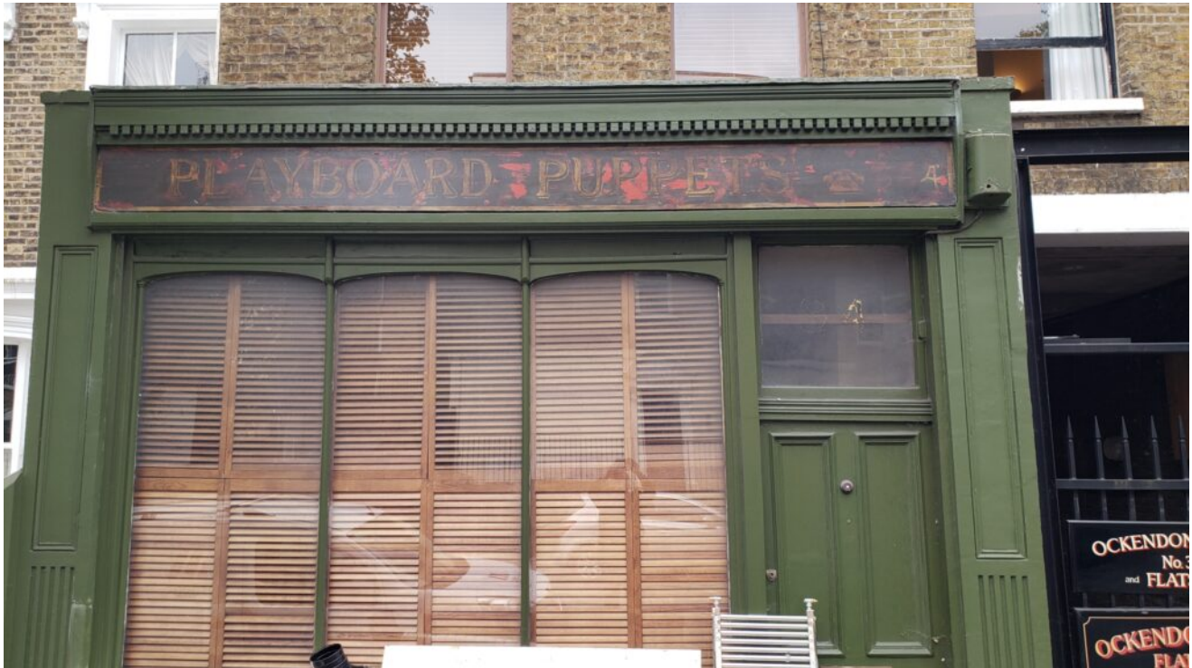
Storefront on Ockendon Road, Islington