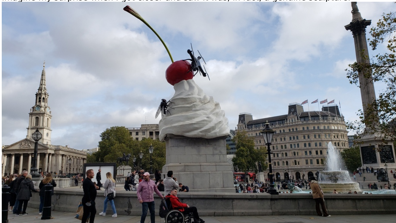
The Fourth Plinth installation, Trafalgar Square

I honestly had assumed that this was not a statue but a street performer. It's such a classic pose for one of those fake statuary so popular around Leicester Square and Covent Garden. Imagine my surprise when I got closer and saw it was, in fact, a genuine sculpture.